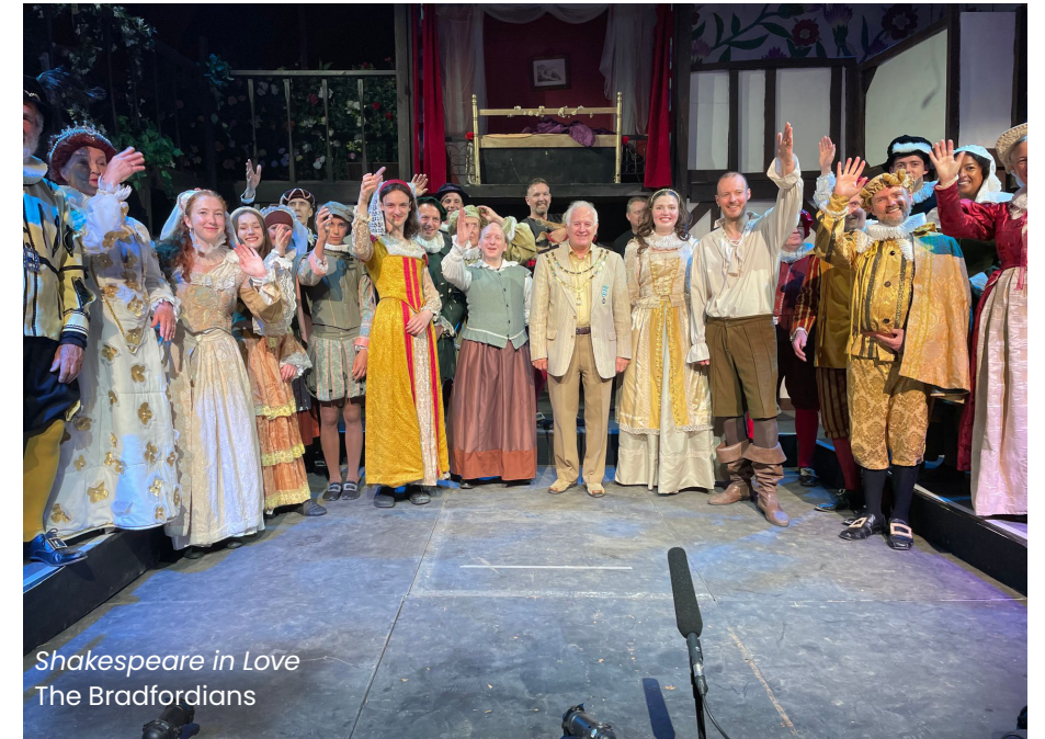
Shakespeare in Love The Bradfordians