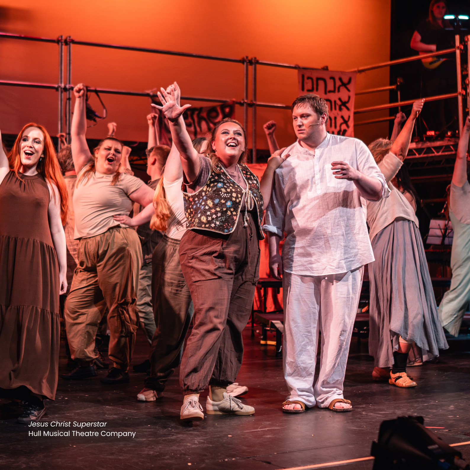
Jesus Christ Superstar Hull Musical Theatre Company