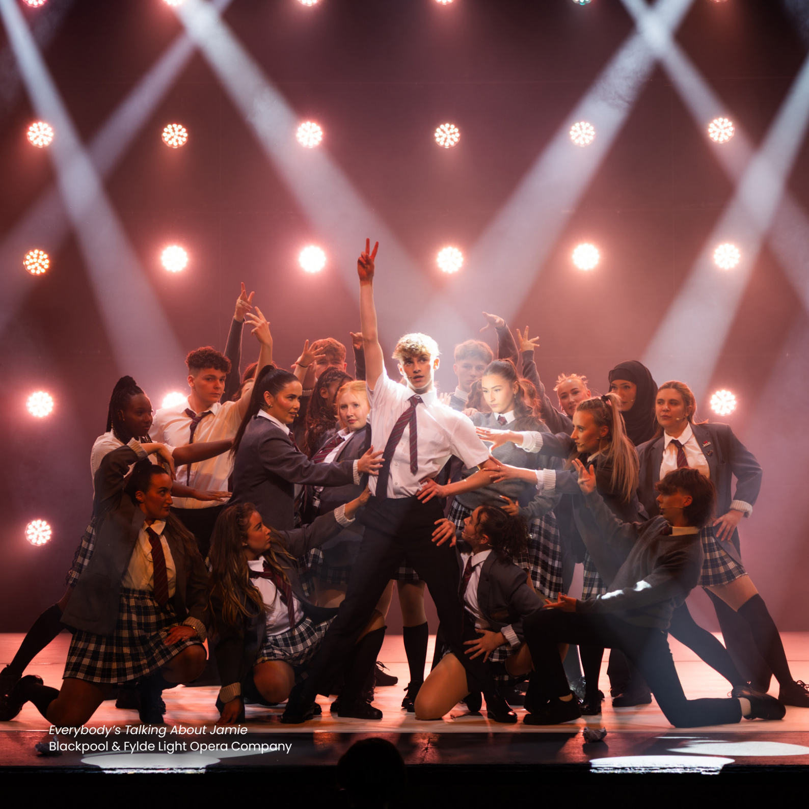
Everybody's Talking About Jamie Blackpool & Fylde Light Opera Company