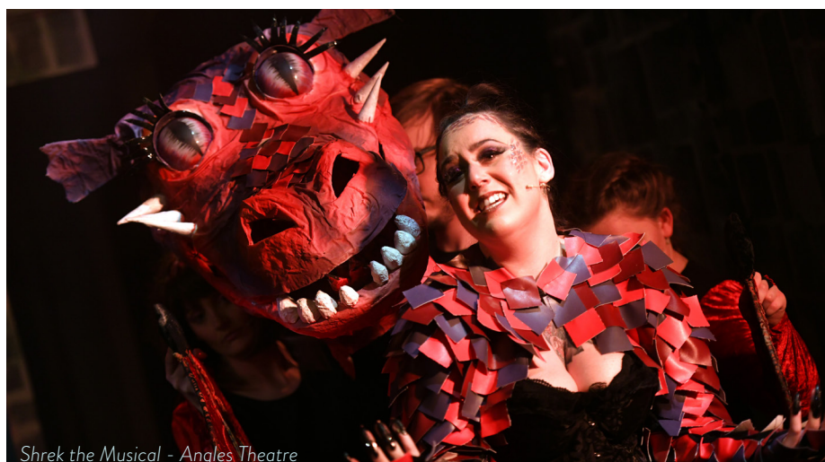
Shrek the Musical - Angles Theatre

In 2021, three regions were able to hold their events welcoming members in person. Other regions held their AGMs and conferences virtually.