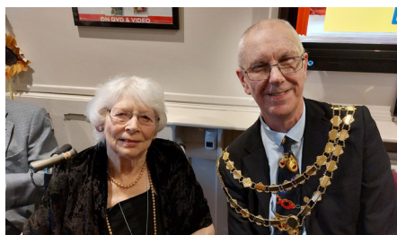
Grassington Players - Calendar Girls première

Those that know me know how much I dislike trains, yet the long and arduous journeys were worthwhile by the 'prize' at the end. One such journey consisted of eleven and a half hours on a train, four station changes to end up in St Ives in Cornwall to see two fabulous productions by Kidz'R'Us. Another memorable journey was seeing a matinee of Evita in Portsmouth, followed by a production of Calendar Girls (the play) up in Lerwick, Shetland some 28 hours later.