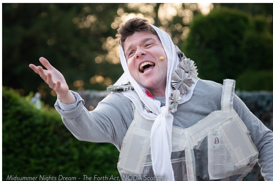
Midsummer Nights Dream - The Forth Act, NODA Scotland

Fundraising is undertaken by the charity and monitored by the trustees. There are no external fundraisers. The CIO has received the support of the Benefact Group with a donation to support a youth development programme.