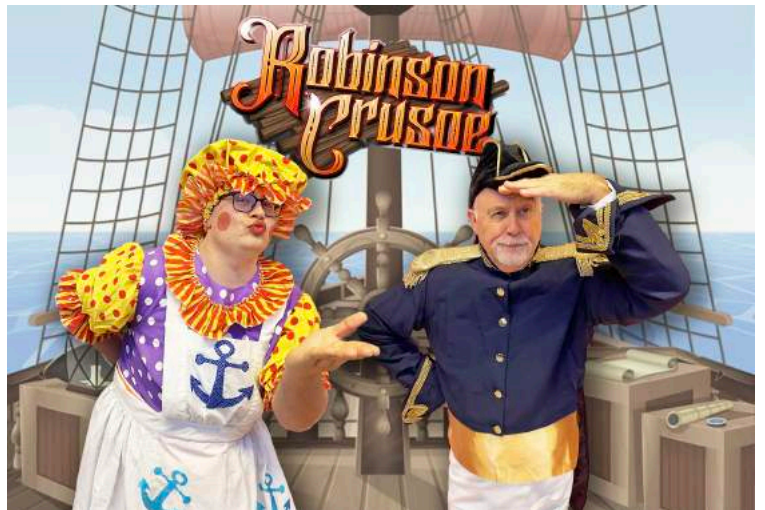
Publicity photos of Robinson Crusoe from Priory Players