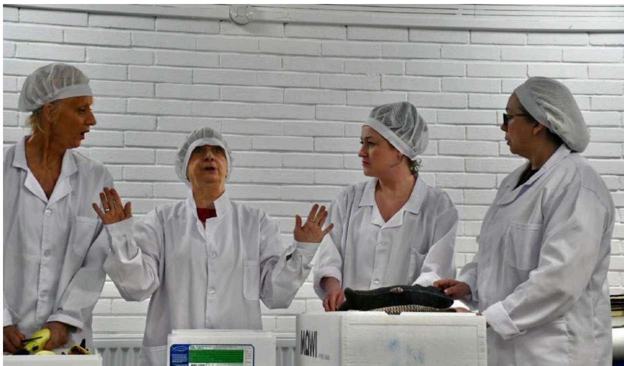
Barnes Community Players production of Ladies' day .

As the year unfolds, I'm looking forward to connecting further with my District 3 groups, being a supportive force and seeing some brilliant productions. The stage is set for an extraordinary journey ahead and I couldn't be more thrilled to be a part of it all.