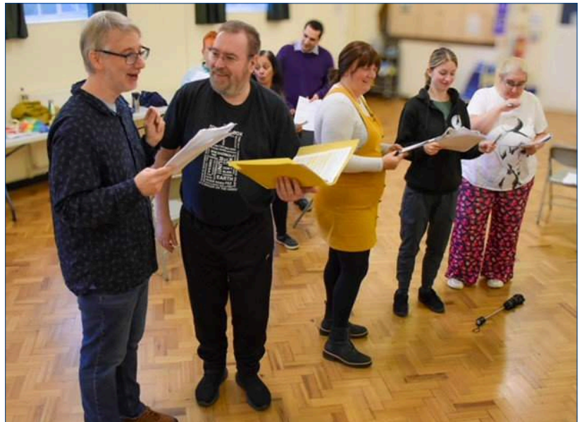
The Chameleons in rehearsal for Dick Whittington.

Musical societies are normally building up to their Spring shows at this time of year but this year neither of my District 9 groups are booked for a big musical. WOS Productions will be performing "Show Offs" a compilation of songs from shows that the members would like to sing but would not normally have the chance to - this should be an entertaining programme. KLOS Musical Theatre were also planning a compilation production this Spring following their Autumn 23 show "Bad Girls - The Musical" but no further information is available as yet. Harrow Opera Workshop have not performed for more than a year now but are due to present two short operas in April at the Compass Theatre Ickenham - namely Puccini's "Il Tabarro" and Menotti's "The Medium". Which will be most interesting - both are new to me.