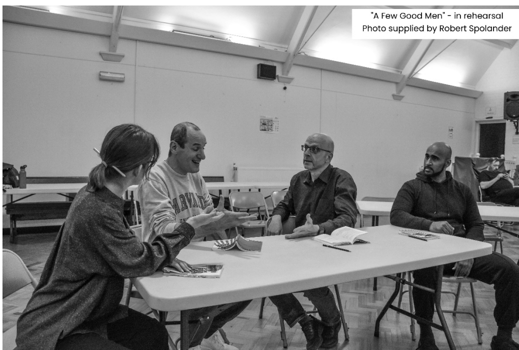
"A Few Good Men" – in rehearsal

KLOS Musical Theatre held a fund-raising event in September as they plan a full scale musical, Half a Sixpence , next March.