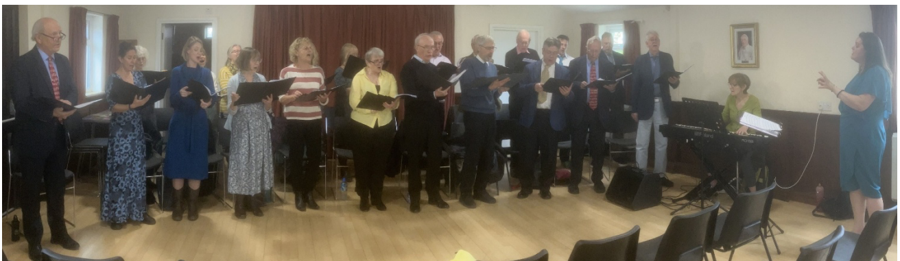
The choir of past and present members of Oxford Operatic Society rehearse before the Memorial Concert on 4 th October 2025