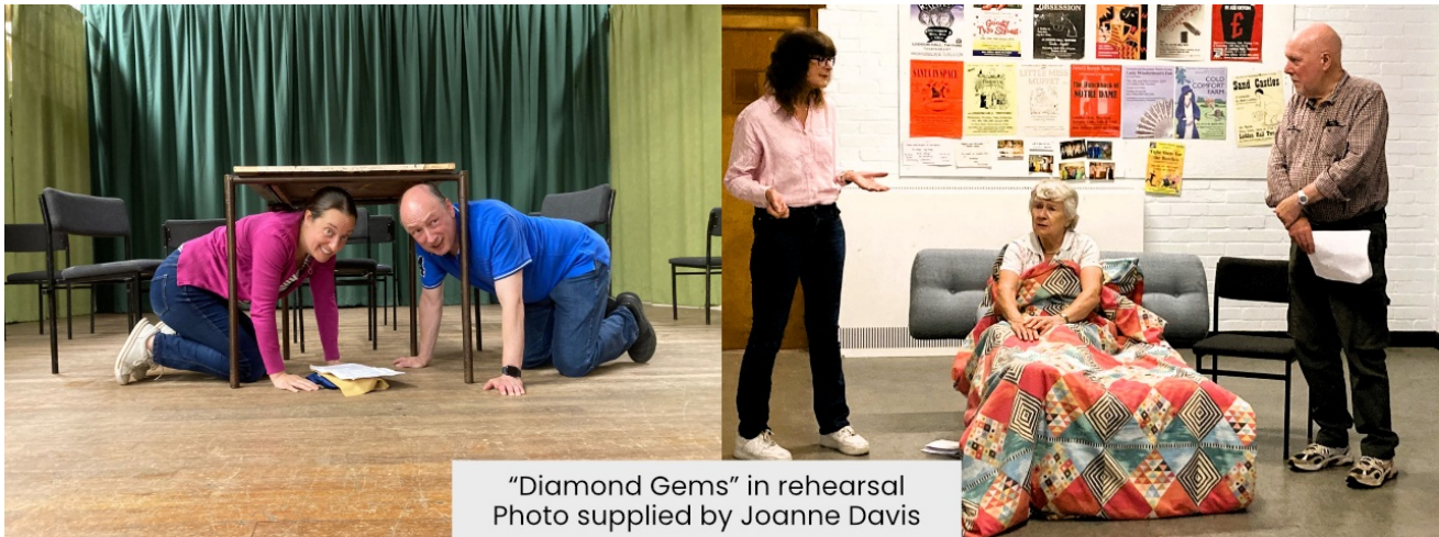
"Diamond Gems" in rehearsal

This season started with a humorous review entitled Let's Talk About Shakespeare which featured all things from the bard himself with a theatre supper thrown in. From witty monologues and comedy duologues to sunny solos and vibrant group numbers, this show from Kennet Amateur Theatre had it all.