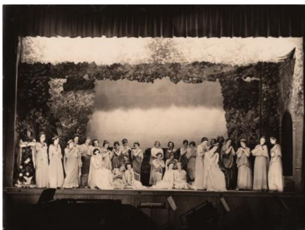
Patience 1939

The history of the College Amateur Operatic Society (CAOS) has been closely entwined with the history of Waltham Forest College (WFC). South West Essex Technical College & School of Art was opened in 1939. College classes had commenced the previous September and CAOS, as an evening class, gave its first performance of Patience on Thursday, 20 th April, 1939. With a cast of 48, 32 women and 16 men, one wonders how they managed on such a small stage. A note in the programme (cost 2d) states 'ladies are requested to remove their hats during the performance. How times have changed!