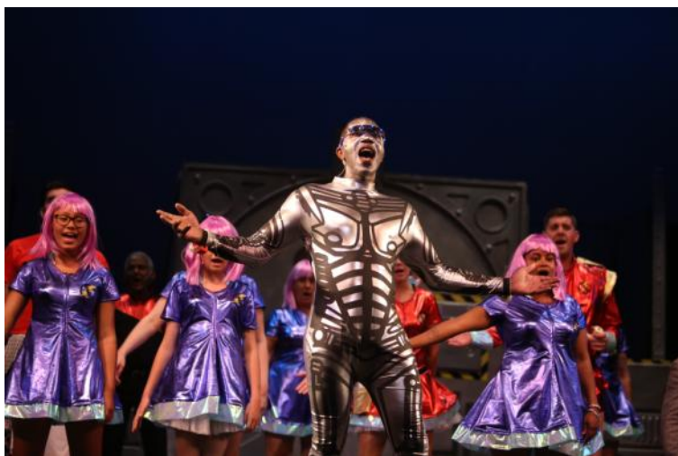
Return to the Forbidden Planet, July 2013