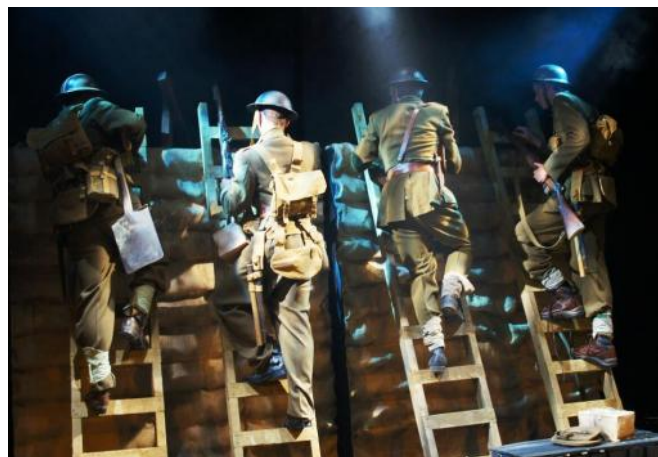
My Boy Jack, October 2012

Thankfully, the process of joining has changed considerably, and would-be members no longer need face an X-factoresque grilling! Aspiring actors are invited to read as part of an informal group (often followed by a trip to the pub) prior to play casting, but anyone with an interest in participating is welcome to join. The membership includes set builders, artists, seamstresses, marketeers, stage managers and production assistants together with a brigade of helpers who pick up all kinds of miscellaneous jobs.