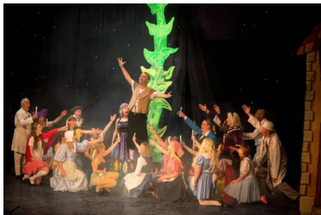
Jack and the Beanstalk December 2013

The Quay Players managed to secure funding for a three day youth workshop of singing, dancing and acting during the February half-term. This turned out to be a huge success, and many of the children returned to audition for the role of Pugsley in The Addam's Family. Two young boys will share the role performing two shows each during the run. They are hoping to hold future youth workshops, as many of the parents were asking for the dates of the next one!