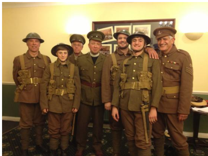
The cast of The Princeford Pals