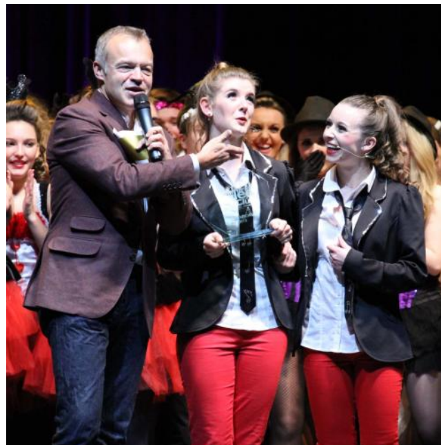
Graham Norton presenting to 2013 winners Finch Stage School

Over 1200 performers have taken part in this fantastic competition since it launched in 2011. It is a flagship programme of the Jack Petchey Foundation inspired by the hugely successful and award winning Glee TV series. The Challenge is open to schools, youth clubs, drama and dance groups, friends with a passion for performing, established groups or those just starting out. This is, however, not just a competition, the top 30 groups will be put through their paces at a series of boot camps and workshops by industry professionals to hone their performing skills.