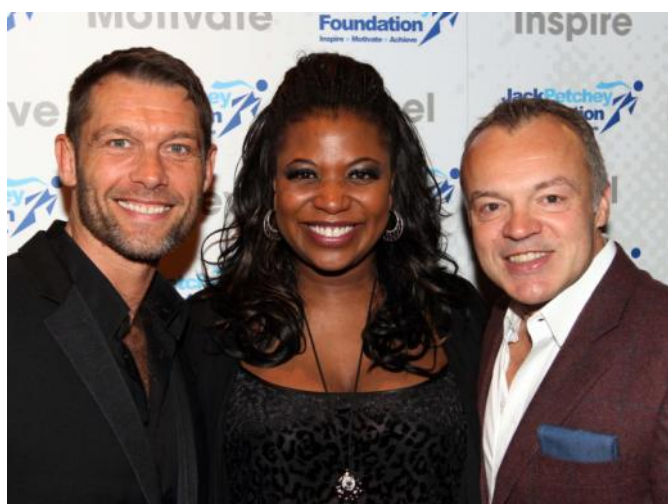
Patrons and Judges – John Partridge, Brenda Edwards and Graham Norton

TV's Graham Norton, Patron of the Challenge, will once again head the judging panel at the spectacular Gala Final. He said "Every year I am moved by these young people. There is so much passion in their performances it brings a tear to the eye. They are a joy to watch and a real challenge to judge. Everyone should enter!" The other celebrity patrons and judges include TV and West End personalities John Partridge and Tamzin Outhwaite and X Factor finalist and current star of We Will Rock You, Brenda Edwards.