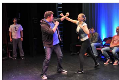
2012 Fight Workshop