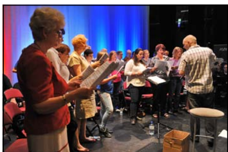
2012 Singing Workshop

All details of the conference will be with you and on the website during the week beginning 5 th May so please look out for them. I am hoping to send many electronically this year to help cut the cost of postage.