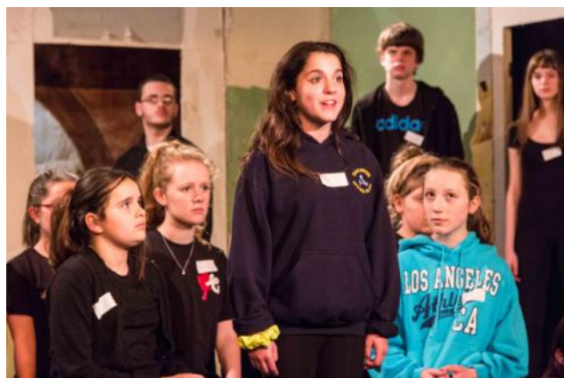
Participants at the May 2014 Workshop rehearse Les Miserables