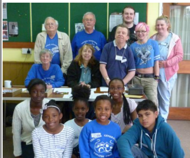
Some of the Management and Production Team with some of the cast for this year's show

This unique UK national honour was created over a decade ago by Her Majesty to mark the Golden Jubilee in 2002 and to recognise the outstanding contributions made to local communities by groups of volunteers; it has an equivalent status for voluntary groups as the MBE has for individuals.