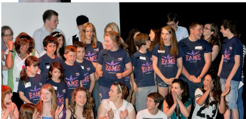
Ruislip Operatic Stageworks hear that they have won the Youngstars Award for their production of Fame