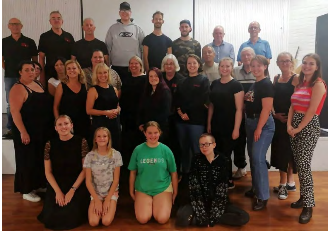
The cast of 'Flames of Injustice' mid-rehearsal