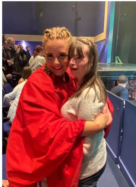
Photographs from the Bromley Players relaxed performance of 'Shrek'