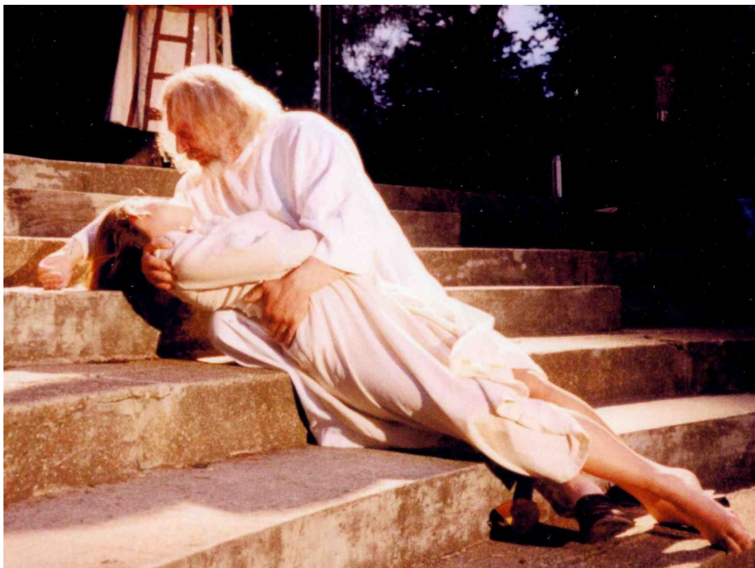
King Lear

A committee selects each year's play from suggestions and proposals to direct. Everyone can apply and everyone is welcome to audition – the group always embraces new members and fresh talent. This year's production is TWELFTH NIGHT , playing at the theatre from July 27 th to July 30 th .