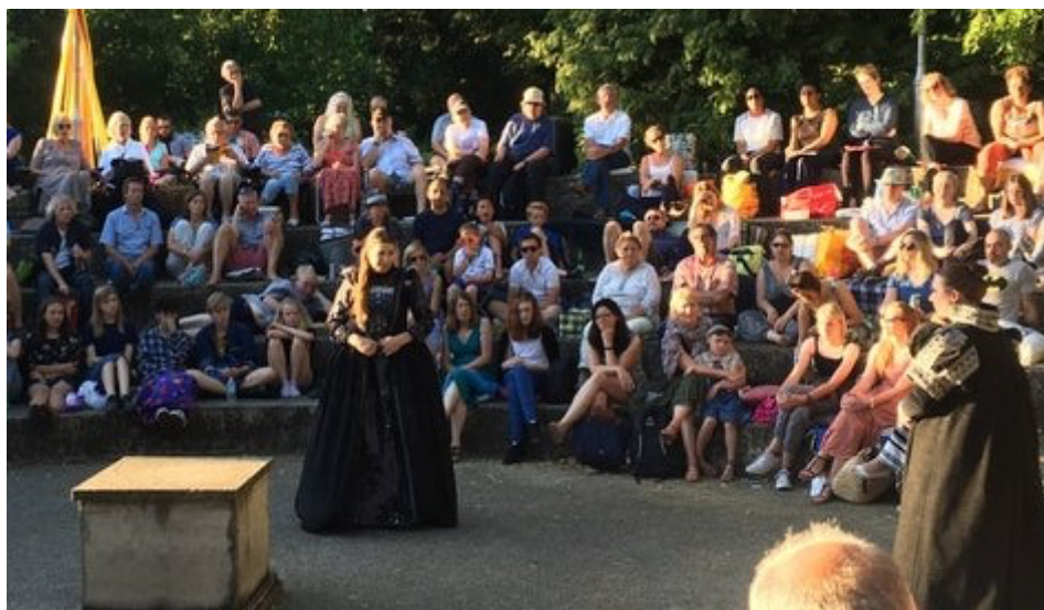
As You Like It

Imagine, if you will, that you are a 1920s schoolgirl. How excited would you be when told that the council offered to build a swimming pool in your school grounds? What would you then feel when you find out your new Headmistress has persuaded them to build a replica Greek Theatre instead?