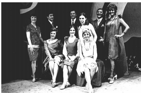
Cast of No No Nanette 1972