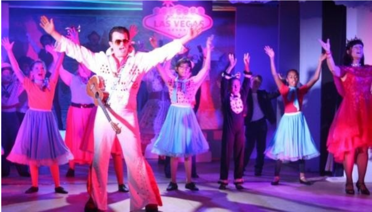
Riverside Players production of Dick Whittington