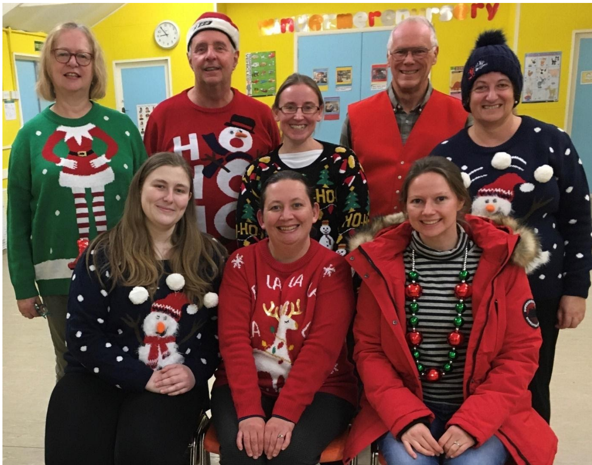
WOS members in festive mood!!