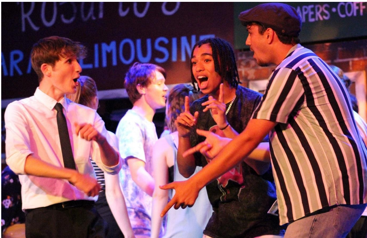
YBOS (Youth of Banbury Operatic Society) – In the Heights