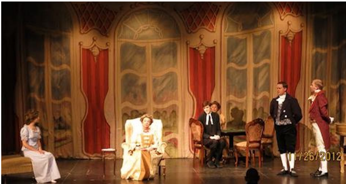
Ruislip Operatic Society’s production of Pride and Prejudice – The Musical

For more information on Pride and Prejudice - The Musical , go to https://www.prideprejudicemusical.com , There, you can listen to the music, see video clips of performances, and download the reviews brochure .